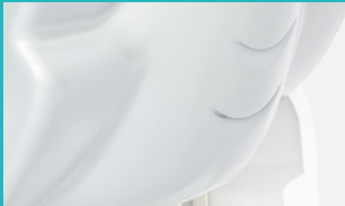
Steels Baosteel from Fortune Global 500.

SAIKANG medical, as a pioneer in the field of medical furniture, always choose branded suppliers strictly to ensure the safety and reliability of raw material. SAIKANG adopt robot welding, automatic epoxy coating, efficient assembly line, dedicated operator, rigorous quality control, only to guarantee SAIKANG's commitment on quality