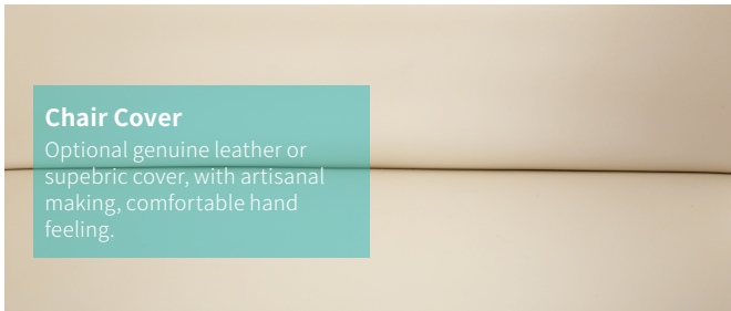
Chair Cover Optional genuine leather or supebric cover, with artisanal making, comfortable hand feeling.