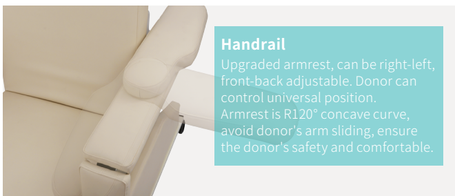
Handrail Upgraded armrest, can be right-left, front-back adjustable. Donor can control universal position. Armrest is R120° concave curve, avoid donor's arm sliding, ensure the donor's safety and comfortable.