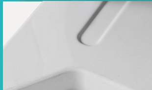
Plastic 11 Process epoxy painting, ASTM testing anti-bacterial, paint thickness 0.12mm, brightness 60°, paint can resist 50kg impact.