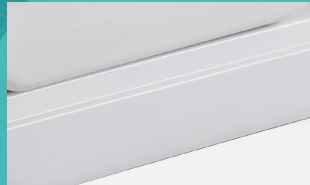
Welding Panasonic Robotic ensure 360° full smooth wedding.