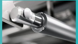
Electric Motor Linear motor, with UL/ROHS/EN standard. Noise under 50 dB, with lifetime 20,000 times movement.