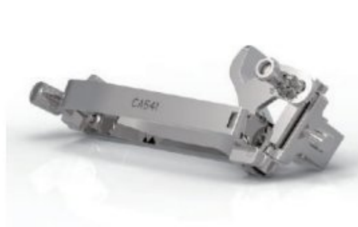
Biopsy needle guides for Esaote CA541 probe (Convex type probe)