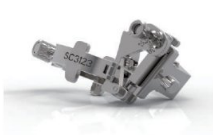
Biopsy needle guides for Esaote SC3123 probe (Microconvex type probe)