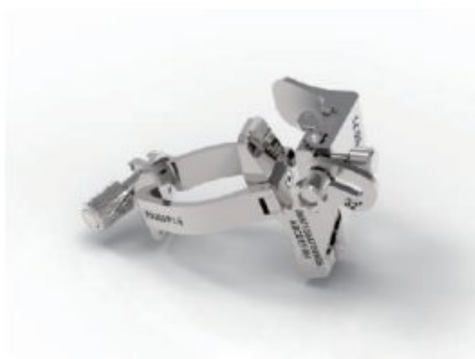
Biopsy needle guides for Esaote P1-5 probe (Phased array type probe)