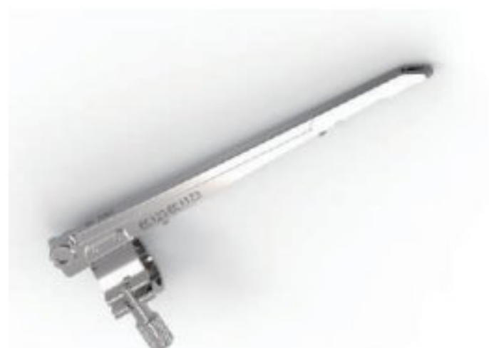
Biopsy needle guides for Esaote EC123 probe (Transvaginal type probe)