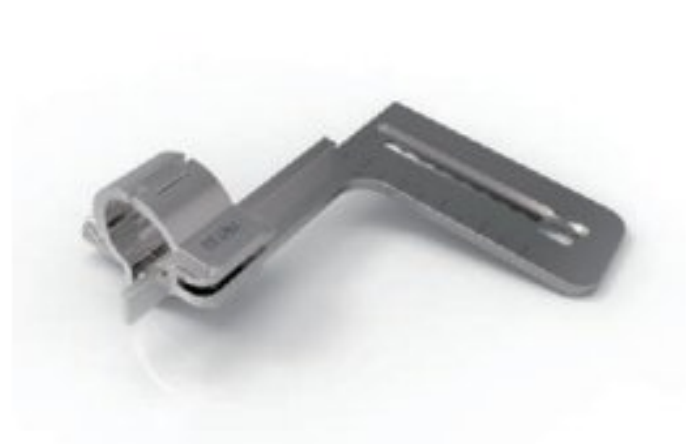
Biopsy needle guides for Esaote TRT33 probe (Biplane Transrectal type probe)