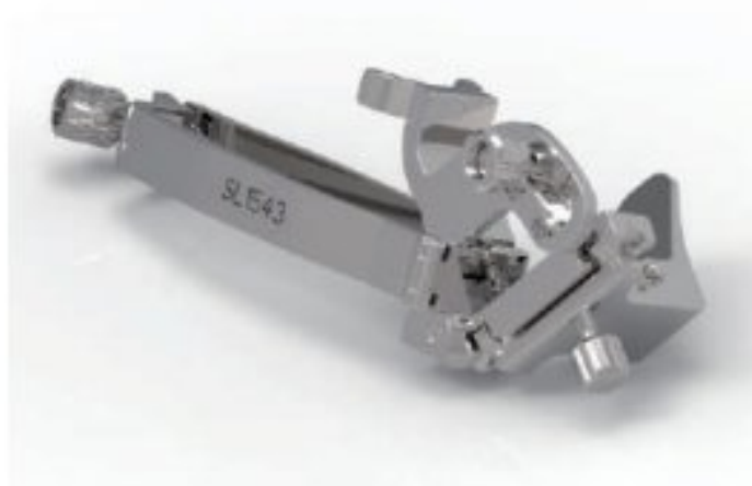
Biopsy needle guides for Esaote SL1543 probe (Linear type probe)